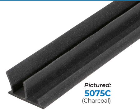
Pictured: 5075C (Charcoal)