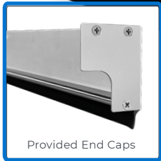
Provided End Caps