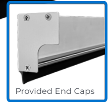
Provided End Caps