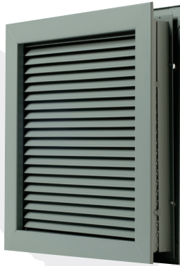
Undersized 1/8" for Clearance

No Vision Door Louver For 1 3/4" Thick Doors